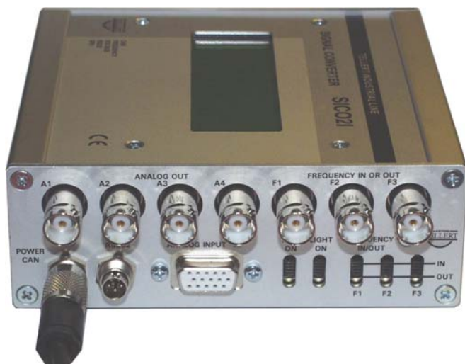
Figure 3: Signal converter SICO2I (Connectors).

SICO2I does not support quadrature signals (unlike SICO2 or SICO2B ).