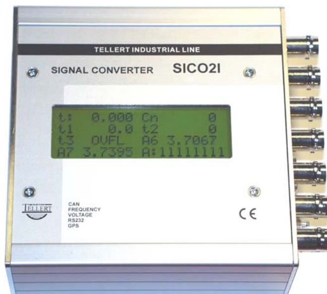
Figure 4: Signal converter SICO2I .

SUB-D-socket (Type HD15) pin assignment: