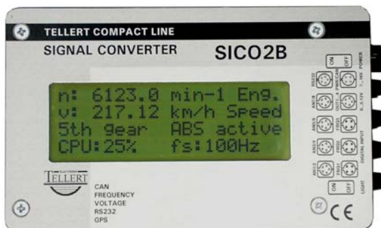
Figure 2: Signal converter SICO2B .

The pin assignment of SICO2B is the same as that of SICO2 .